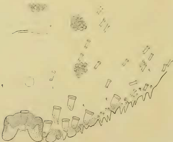
Figure 40. Anal plate of the manzanita scale, Aulacaspis manzanitæ n. sp. (Original)

Puparium of the female approximately circular; moderately convex; exuviae subcentral or towards the margin. Color varying from pale yellow to dusky yellow, or pale brown. Diam. 1.75 to 2.25 mm.; puparium light brown or gray to a dark brown; light gray at margin. Ventral scale appearing as a very thin whitish scar on the leaf after the removal of the insect. Male not known.